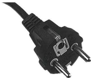
CEE 7/7 plug

The Speedster 220-240 VAC version may be equipped with a CEE 7/7 plug. The 110-120 VAC version comes without plug. If the machine comes without a plug fitted, please ensure that you have a suitable plug to match the wall socket, or have the machine directly installed in the wall installation box.